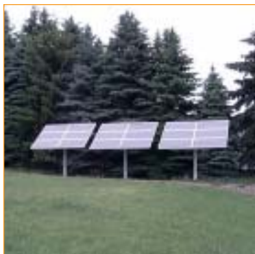
Sharp multi-purpose modules offer industry-leading performance for a variety of applications.