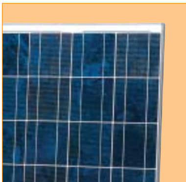
Solder-coated grid results in high fill factor performance under low light conditions.