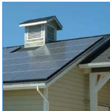
Sharp RESIDENTIAL SYSTEM modules offer outstanding performance for a variety of applications.