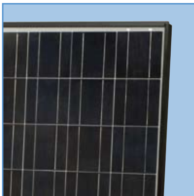
Special side flanges mount easily and securely to Sharp's innovative solar racking system